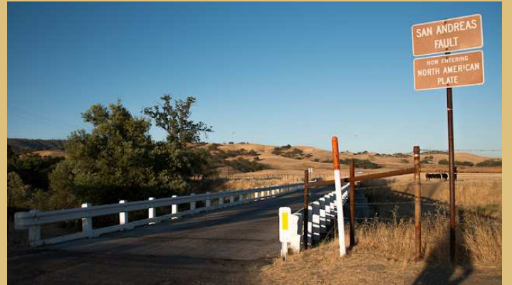
Parkfield - San Andreas Fault - Parkfield Cafe