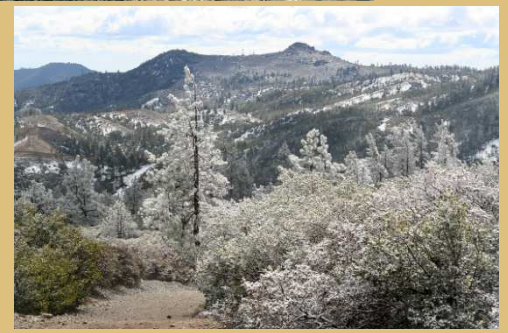
San Benito Mountains - Highest Point in the Diablo Mountain Range