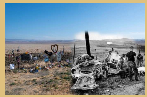
CA 41 & CA 46 Crash Site - Now & Then (1955)