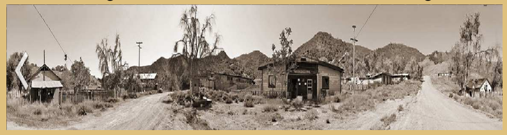
Idria (or New Idria) was a quicksilver mining town - panorama view